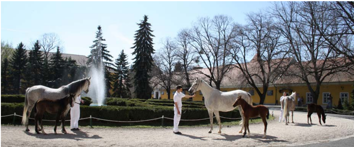
Breed presentation in the central Bábolna stud yard

On April 16 th and 17 th 2013 the directors of the ESSA partner institutions gathered at the Hungarian National Stud BÁBOLNA for their annual general assembly. The conference was accompanied by a visiting programme to the different parts of the stud, which is known as the birth place of the Shagya Arabian breed. As in many European state studs reconstruction and new building projects are undertaken, to adapt the historic stud premises to modern use.