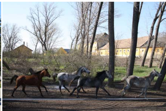
Foals on their way to the stables