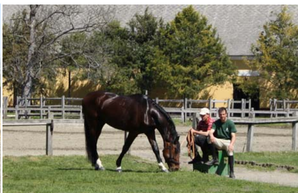
Sport horse after the training