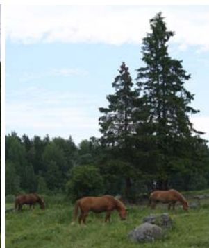
Schoolhorses on holiday