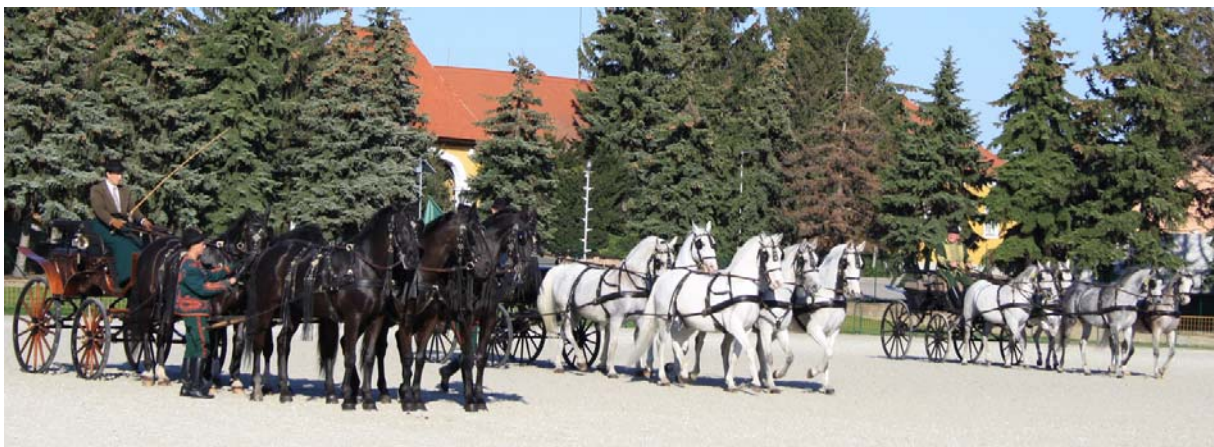
Carriages from Mezöhegyes, Szilvásvárad and Bábolna in the show programme