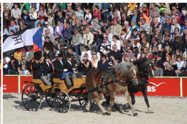
Guests from Tlumačov