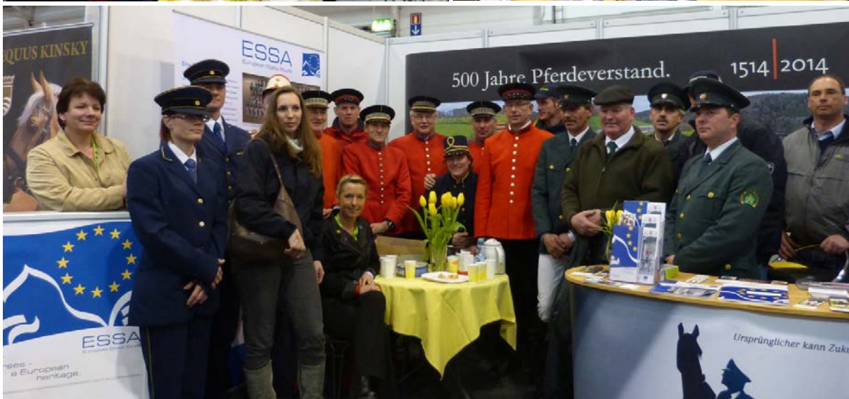
ESSA team at the Equitana information stand