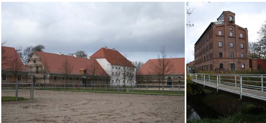
Neustadt-Dosse: scaffoldings at some of the “Hauptgestüt”- buildings

At REDEFIN a new training stable with paddocks and a second indoor arena are already operating, while the historic stable Nr. III is supposed to be ready for use after intensive renovation at the end of the year. At NEUSTADT-DOSSE reconstruction work is going on at the last buildings of the historic “Hauptgestüt”- complex. The former mill has been turned into a dormitory of the boarding school.