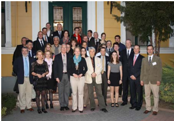
Participants of the festive evening, Photo S. Först