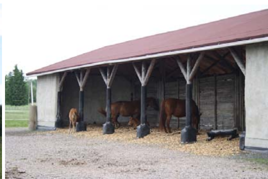
Finnhorse mares and foals