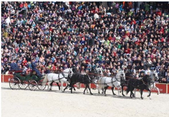
Eight-in-hand with Oldkladruber stallions