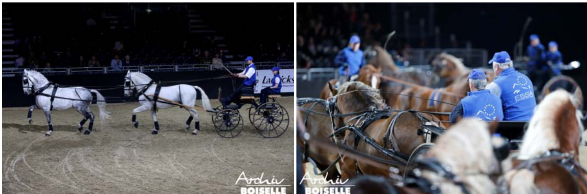
ESSA tandem quadrille at Equitana 2013

From March 16 th to 24 th ESSA participated with the theme “ Save Heritage and Biodiversity ” at the world's leading equestrian fair Equitana at Essen (Germany). A quadrille of mounted and carriage tandems celebrated its premiere, demonstrating traditional horse training and the diversity of breeds maintained in the European state studs.