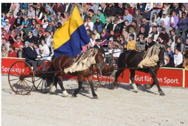
Coldblood stallions from Písek in a sulky-quadrille