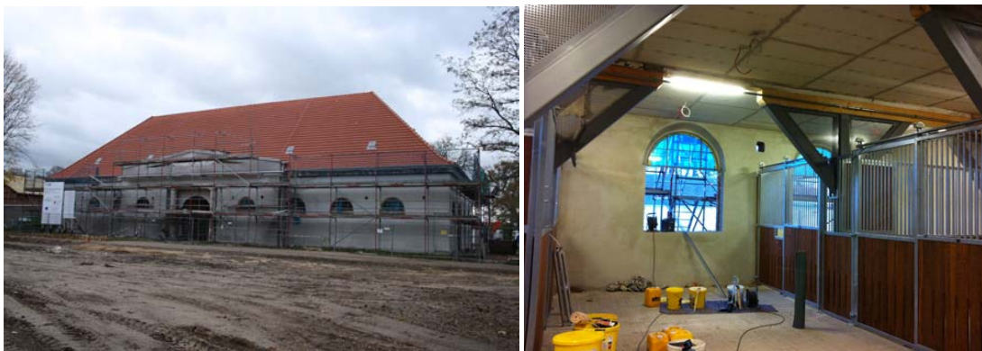
Redefin: stable Nr. III from outside and with new boxes, more space and more light inside.