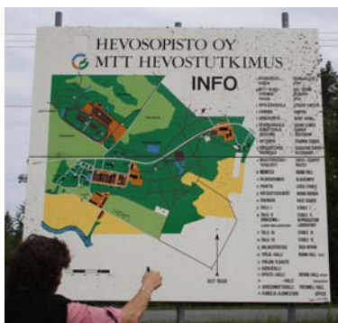
Päivi Laine explaining the site

Thanks to Päivi Laine and Kirsti Piminäinen for being such wonderful hosts and guides!