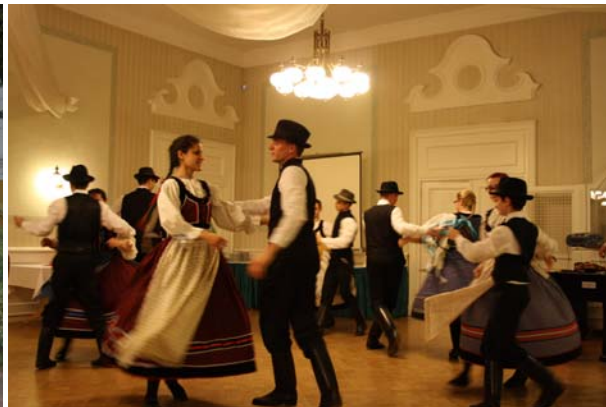
Traditional music and dance