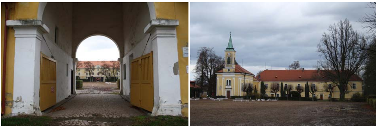
Despite being recognised as national monuments the buildings of Kladruby nad Labem urgently need repair.