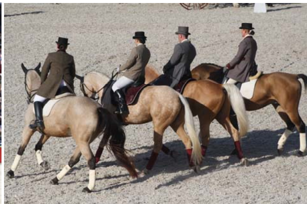
Kinsky horses under the saddle