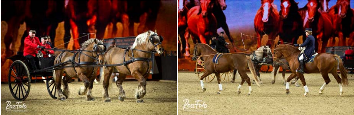
ESSA tandem performance at Equitana 2013