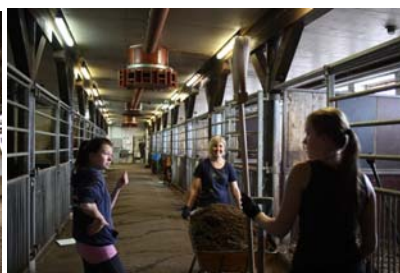
Students at work